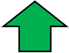
Instructional Reading level in Literary Realistic Fiction Strand for 9th and 10th Grade Students

Group Average Instructional Reading Level